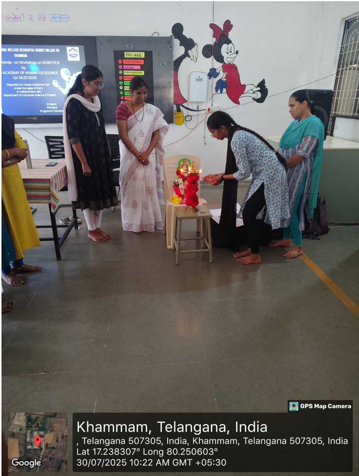
Lightening of Lamp